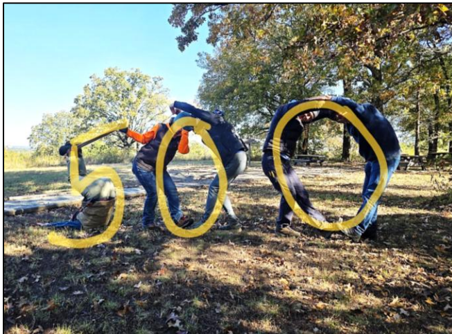
Volunteers commemorating the 500th bird banded at the Little Rock Audubon Center during the 2025-2026 MoSI banding season.