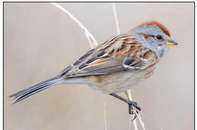
American Tree Sparrow, Faulkner Co.

Perhaps the best time to find an American Tree Sparrow, unless you live in Northwest Arkansas, is to go hunting just after a snow storm. We probably get more during winter than we know, and many snow events indicate this is true. When snow covers the ground, this species is forced to feed near the road's edge, and as soon as the snow melts, they disappear again...back to who knows where.