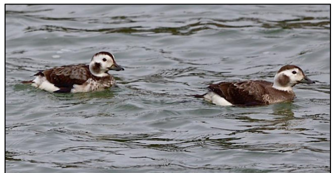
Long-tailed Ducks, Franklin Co.