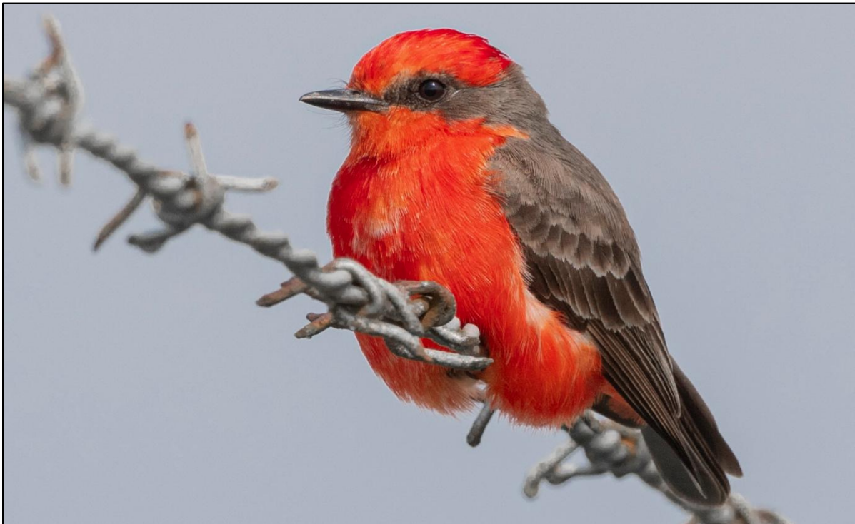
Vermilion Flycatcher

Arkansas Audubon Society, P. O. Box 241421, Little Rock, AR 72223